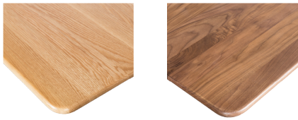
Solid American Oak Solid American Walnut

Solid American Oak or Solid American Walnut Wood is a natural material so each piece will be unique, telling a different story of the condition it grew in. There will be colour and grain variation.