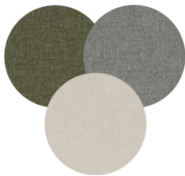
Aloe Green | Pewter Grey Oatmeal Beige