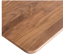
Solid American Walnut