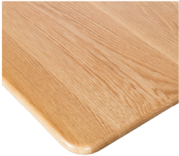
Solid American Oak